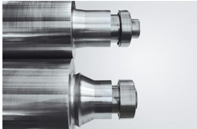
New: high-precision ball bearings

The fountain and pressure rollers within the coating machine are decisive for a continuous and even application of coating. Therefore we recommend to replace the conventional high wear and high maintenance plain bearings by high-precision ball bearings with zero clearance. In that way you can improve your production quality simply by changing the bearings. At the same time the need for daily lubrication of the plain bearings is eliminated.