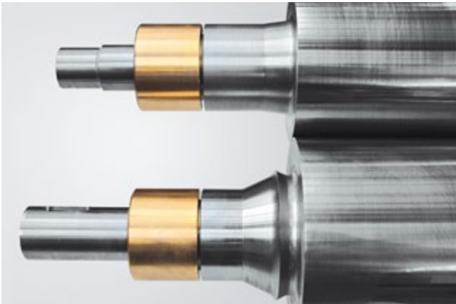
Old: plain bearings

At Koenig & Bauer, we are working continuously on innovations to further improve your printing and coating lines. With our hardware upgrades you stay up-to-date with the latest technological developments. In that way you continue to decorate metal sheets to the highest standards.