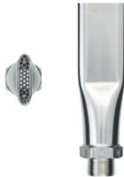
Noise-reducing air outlet nozzles