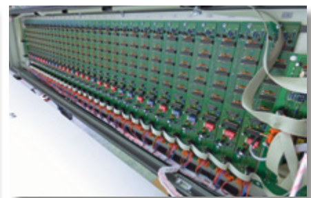
Addressing the ink zone motors

Depending on the technical configuration of your equipment we can offer a comprehensive consultation service. We will be pleased to supply you with a quotation tailored to your specific needs. Talk to our Mr. LineOptimiser! Tel. +49-711-6 99 71-300 · Fax +49-711-6 99 71-185 · Mr.LineOptimiser@kba-metalprint.de